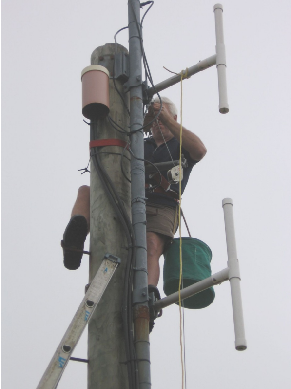
up pole close-up