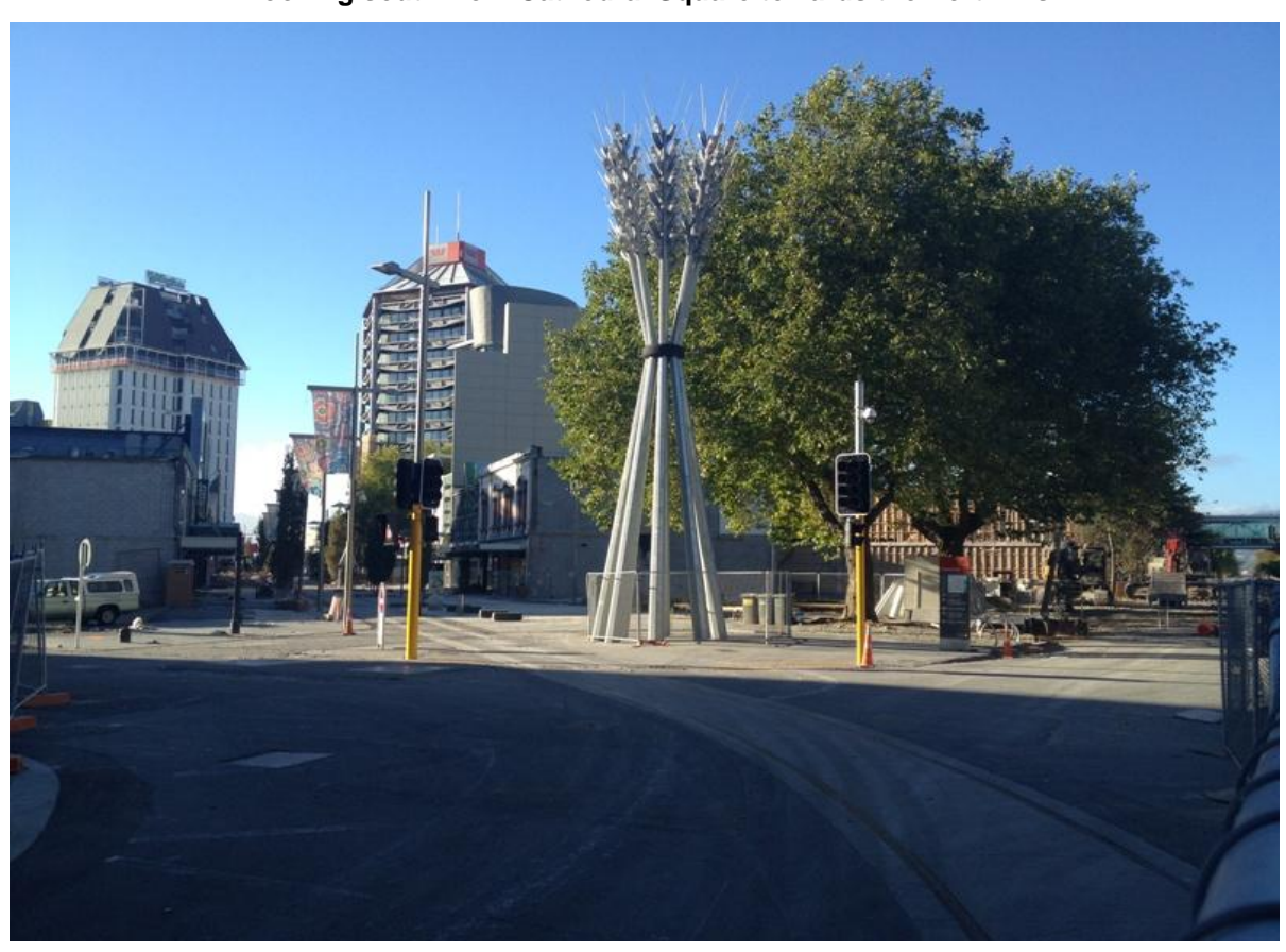
Cashel Street Mall from Colombo Street looking east Debris still there from February 2011 Earthquake