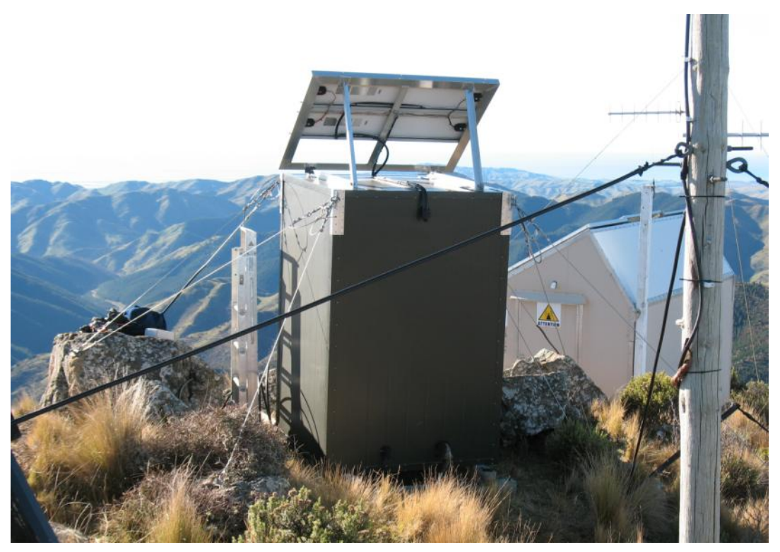
Figure 3: Blenheim 695 Repeater – a 100% solar powered site.

Another outcome from the Conference was the numbers of members of the association - as at the AGM there were 1594 members, a far cry from the required 2000 odd required to keep the association viable. So it's incumbent on us all to try to increase the numbers to that magic 2000 members, so that the association is alive and well.