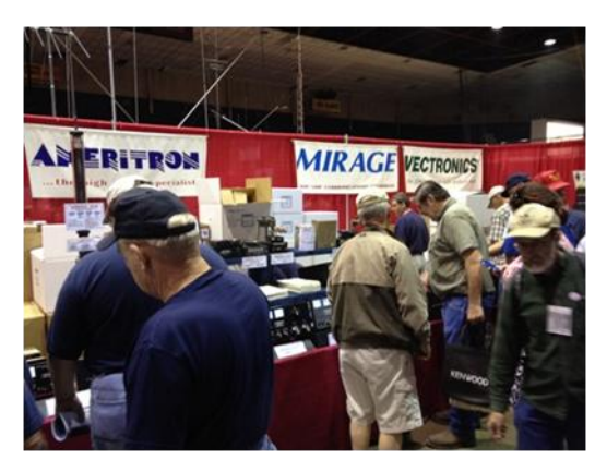
Figure 3: Ameritron and Mirage Booths