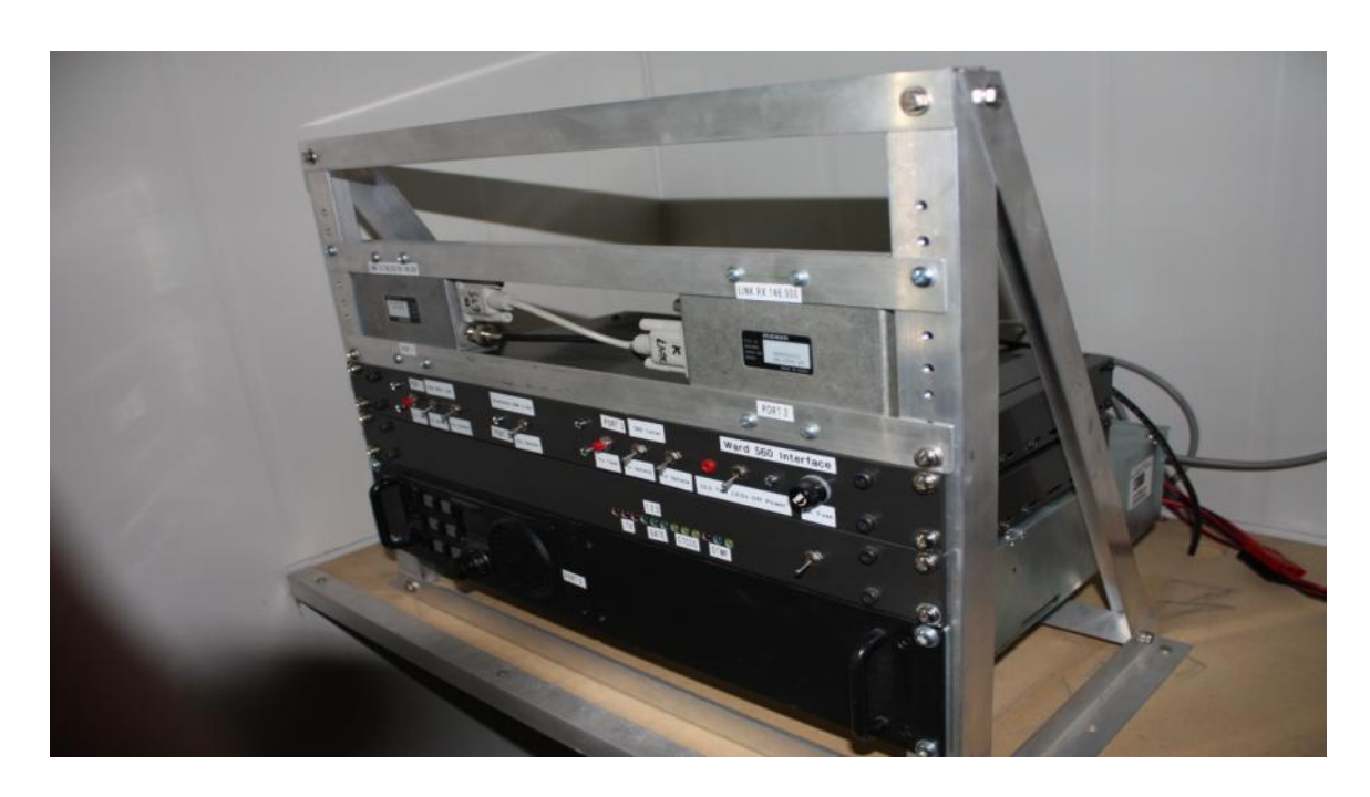
Figure 1: Linked repeater rack – starting from the top are the reverse linking radios, logic controller (all the switches), repeater controller (single switch) and finally the Yaesu VXR9000 VHF Repeater.