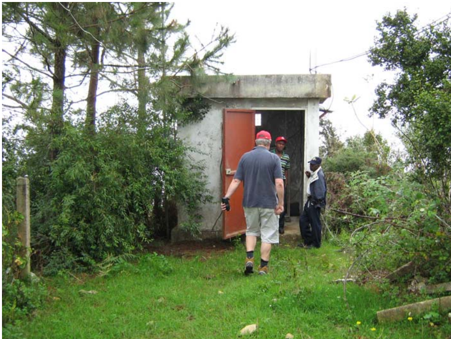
Obleon repeater and mast. Elevation 1930m

The VHF equipment was exclusively Motorola. The normal IFRC kit is GM360 mobiles and GP360 handhelds. A major task is to ensure that they are programmed to suit the local assignments.