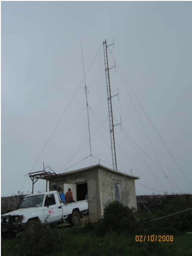
The horizon behind the hut is a fort built in 1790 something still complete with cannon. Elevation 1570 m