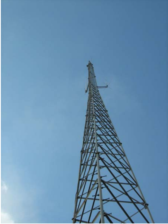
Another repeater at Fort Delpeche. This one used Kenwood equipment. The Hustler aeriels are IFRC standard