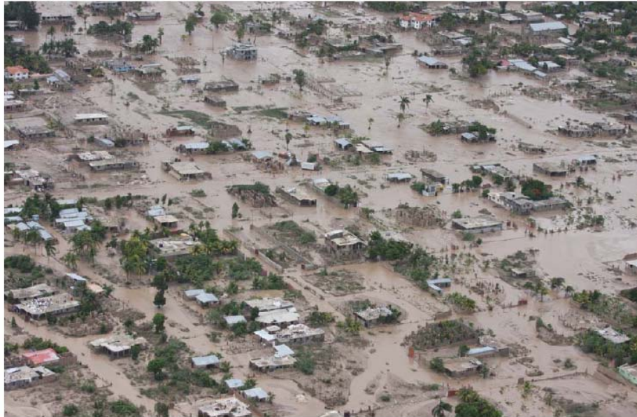
This image shows the devastation caused by the rains brought by Gustav first and then Hanna in one of the affected neighbourhoods in Haiti.

Languages: French (official), Creole (official).