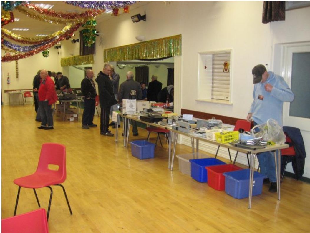
There was a varied selection of items for sale, varying from new to 'not so new' as this photo of part of the hall shows: