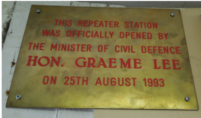
South Hut Plaque