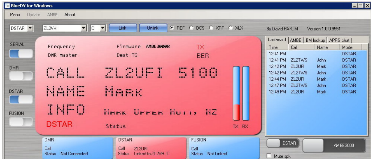
Figure 3. ZL2UFI D-STAR On Air.